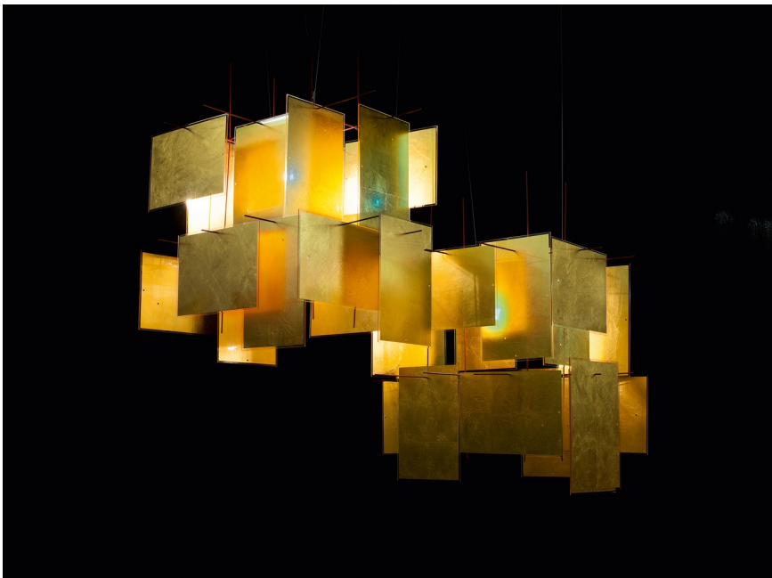
1000 Karat Blau AXEL SCHMID 2009/2016

1000 Karat Blau is a large, impressive pendant luminaire with the effect of a light object. The gold leaf in the acrylic shades reflects the warm, long-wave portion of the light back and forth, creating a particularly cozy atmosphere. As with the smaller 24 Karat Blue, which has been part of the Ingo Maurer collection since 2005, only the short-wave blue light can shine through between the molecules of the gold leaf. This makes the point of light appear bluish. Large clusters can be created by connecting several pieces together.