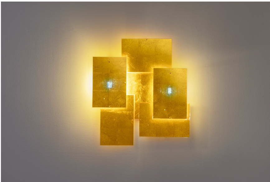
24 Karat Blau Flat AXEL SCHMID 2021

24 Karat Blau Flat is the latest member of the 24 Karat Blau family. The very flat wall light is based on an acrylic glass panel into which gold leaf is cast and which is mounted directly in front of the light source. The wafer-thin gold only allows short-wave blue light to pass through, so that the light point of the luminaire has a bluish shimmer. Warm, golden yellow light is reflected by the gold layer, creating a wonderfully warm atmosphere. One luminaire - many possibilities: With optional additional panels, which can be arranged and aligned in different ways as desired, 24 Karat Blau Flat can be transformed into an individual work of art. The luminaire was developed by Axel Schmid, who has been part of Ingo Maurer's creative team for more than two decades and has already designed the previous models in the series.