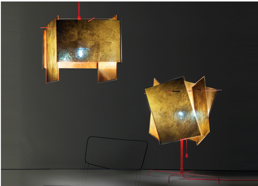
24 Karat Blau AXEL SCHMID 2005

24 Karat Blau by designer Axel Schmid is part of and gives its name to an entire family of lamps by Ingo Maurer. Four shades with gold leaf cast in acrylic glass, metal, plastic: The gold shades of the luminaire each have four holes with which they can be hung on the red rod cross at different angles, in portrait or landscape format. The 24-carat gold leaf shades are made individually by hand. Gold leaf is real gold. It is beaten wafer-thin with a hammer by gold beaters. The gold leaf is beaten 1/10,000 mm thin - the equivalent of 1,000 atomic layers - so that short-wave blue light can shine through between the molecules, while yellow-gold light is reflected. Thanks to the special beating technique, the wafer-thin gold leaf displays a beautiful star-shaped pattern. Axel Schmid deliberately opted for real gold: "With real gold, the energy stays there - inside the luminaire. No gold paint can imitate that. With real gold, there is also the surface structure. In combination with acrylic, precious gold leaf is brought into a format that is easy to handle and maintain." The colors red (rods and cable) and blue (light point) form a beautiful contrast to the gold. 24 Karat Blau can be extended as required: 24 Karat Blau M is the name of the extension module that turns a single 24 Karat Blau into a larger pendant luminaire.