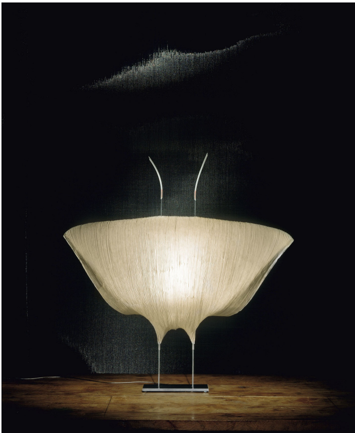
Samurai LED DAGMAR MOMBACH, INGO MAURER & TEAM 1998

Paper, metal, stainless steel, silicone, glass, glassfibre shades. Samurai LED is equipped with a dimmable LED module. The module was developed by Ingo Maurer GmbH especially for the MaMo Nouchies. The light is warm and soft, and can hardly be distinguished from conventional halogen light. In contrast to the halogen version shown in the photos, the cable is visible, as with Poul Poul.