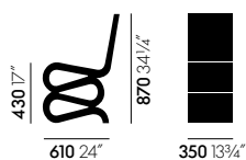
Wiggle Side Chair